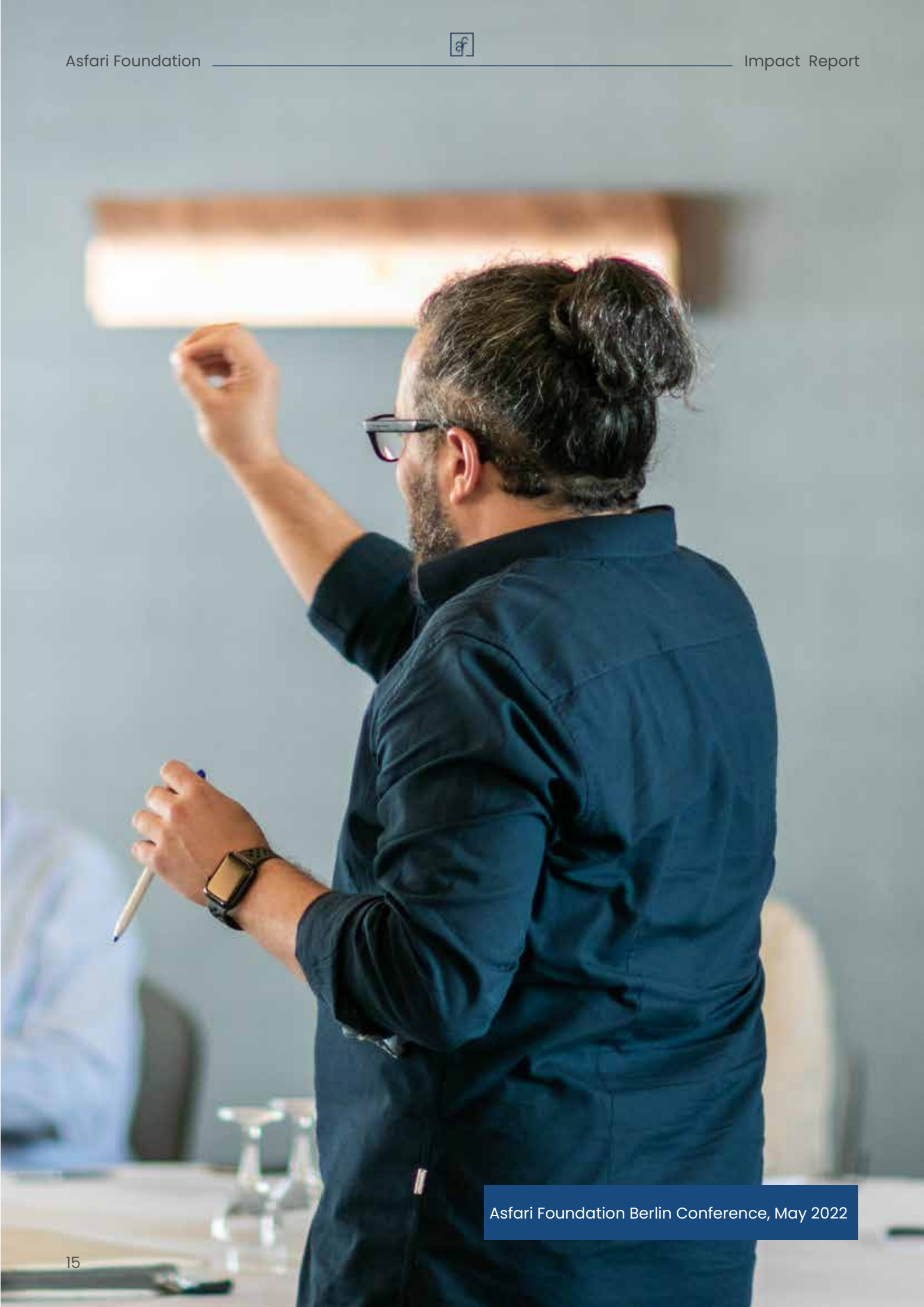
Asfari Foundation Berlin Conference, May 2022